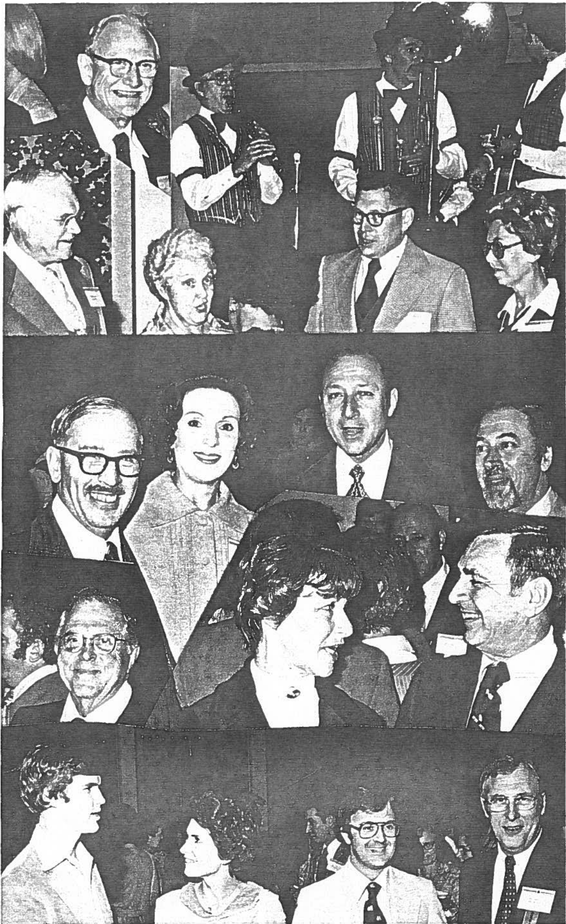
Some of the happy folks at the San Francisco meeting.