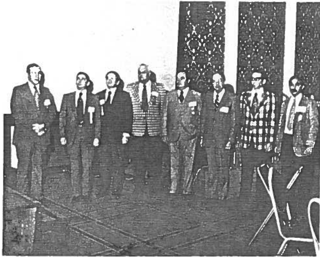
Elected officials present for installation appear above — complete list elsewhere in this newsletter.